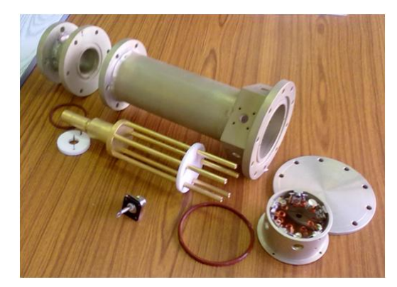
Figure 3 Photograph showing different parts of the five way in-phase equal power divider/combiner

The power divider combiners were measured using R&S vector network analyzer ZVC. The measured input port return loss is nearly 20 dB over the 100 MHz band. All the five coupling is within 7.2 dB for all the five ports and is flat over the 100 MHz band. Variation in insertion phase among the five output ports are within 3 degrees. The measured isolation between adjacent ports which is better than17 dB and it is more than 20 dB for non adjacent ports. The output port return loss and isolation at the centre frequency is close to the theoretical value of 19.0 dB as stated by the design given by Adel [1]. It is found from the measured coupling values that the overall insertion loss of the unit is less than 0.1 dB which is very much essential in high power applications. These results show that the concept stated above for the realization of the 1:5 way power divider/combiner is feasible. Figure 4 shows the power divider/combiner connected to the wind profiler system in an open field. It is covered with a secondary cover for additional protection from rain. The unit has been placed in the field and connected to the system. It had been in operation for many months without any trace of high power breakdown.