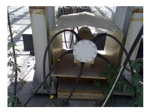
Figure 4. 1:5 way power divider/combiner placed in the field, five outputs can be seen clearly